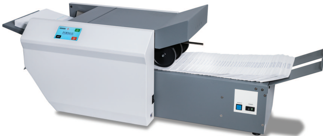
FD 2006 shown with optional conveyor

The FD 2006 AutoSeal ® offers a user-friendly mid-volume solution for processing one-piece pressure sensitive mailers. With a speed of up to 8,000 forms per hour and the ability to process forms up to 14" in length, the FD 2006 enables operators to complete daily processing jobs with ease. The color touchscreen control panel uses internationally-recognized symbols in place of text, making it easy for anyone to use.