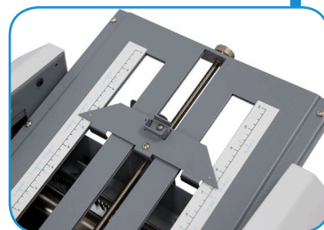
Clearly marked fold plates are easy to adjust